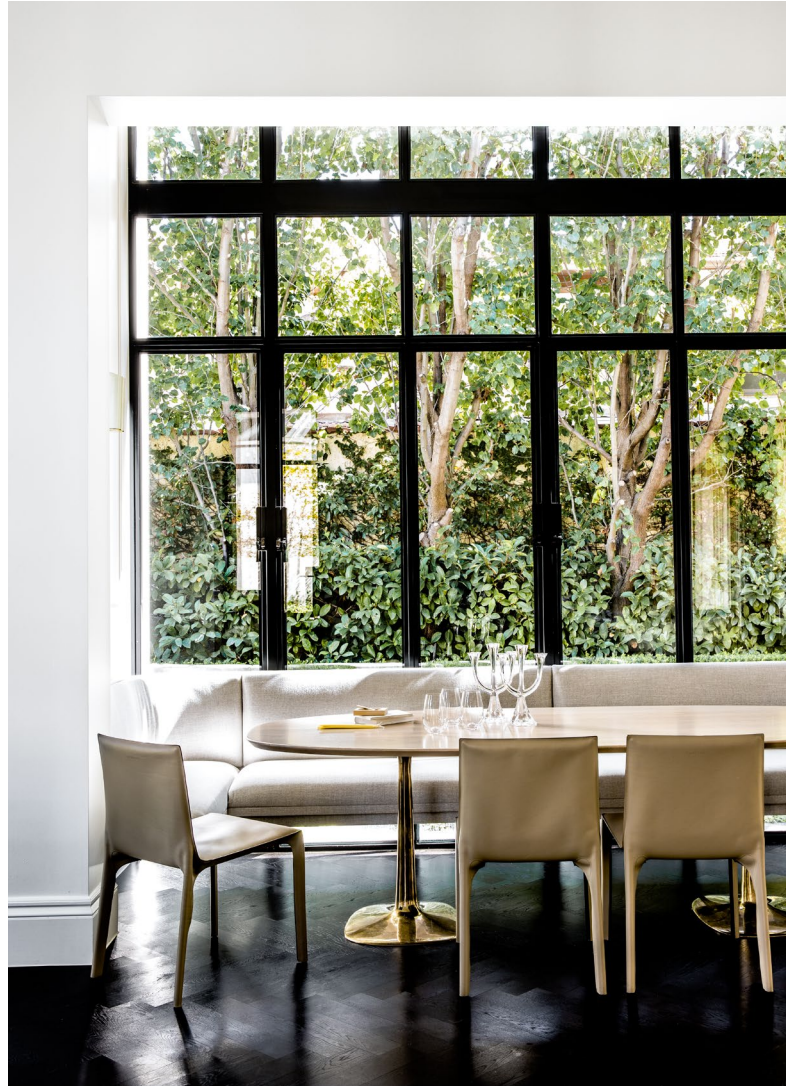
The black steel windows frame the opulent landscape, connecting the interior with the gardens outside.

In this context, nuance in the application of natural materials, such as dark waxed timber flooring, marble and brushed gold fittings, affords a subtle softness to the interiors of Stanley Residence. As a result, the grand spaces “feel settled and ready to be lived in,” explains Sophia. By balancing the generous proportions of interior spaces, humbler design features offer moments to celebrate the rituals of daily family life.